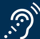
ASSISTIVE LISTENING DEVICE