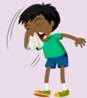
Congestion or runny nose