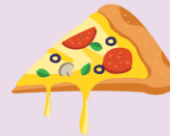
New loss of taste or smell